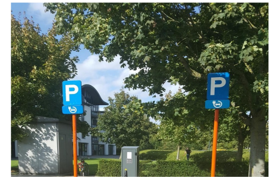
© cities promoting charging infrastructure for shared cars