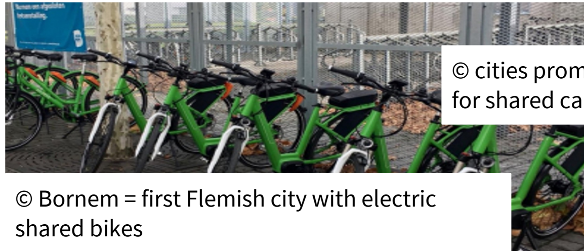
© Bornem = first Flemish city with electric shared bikes