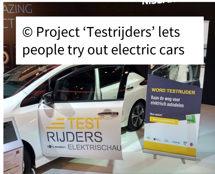
© Project 'Testrijders' lets people try out electric cars