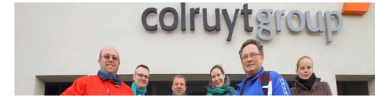
© Colruyt provides electric bikes for employees