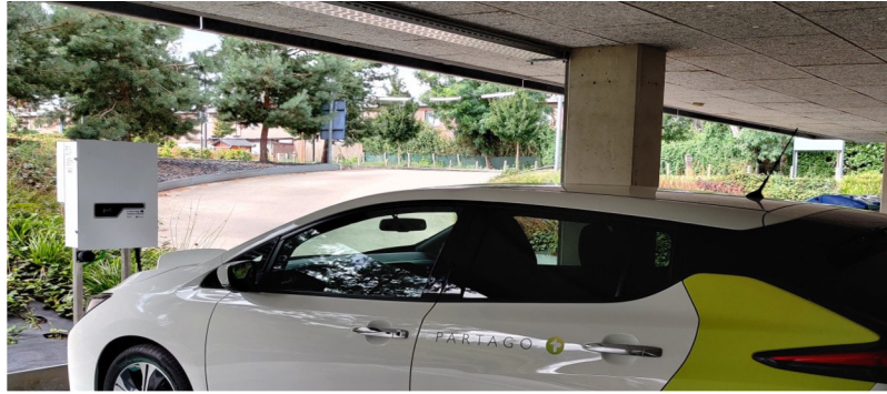
© Partago & Zuidtrant start V2G-opportur for shared cars